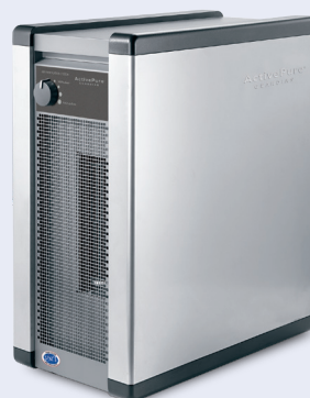
ActivePure® BEYOND GUARDIAN