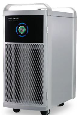
ActivePure® MEDICAL GUARDIAN