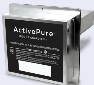
ActivePure® INDUCT GUARDIAN